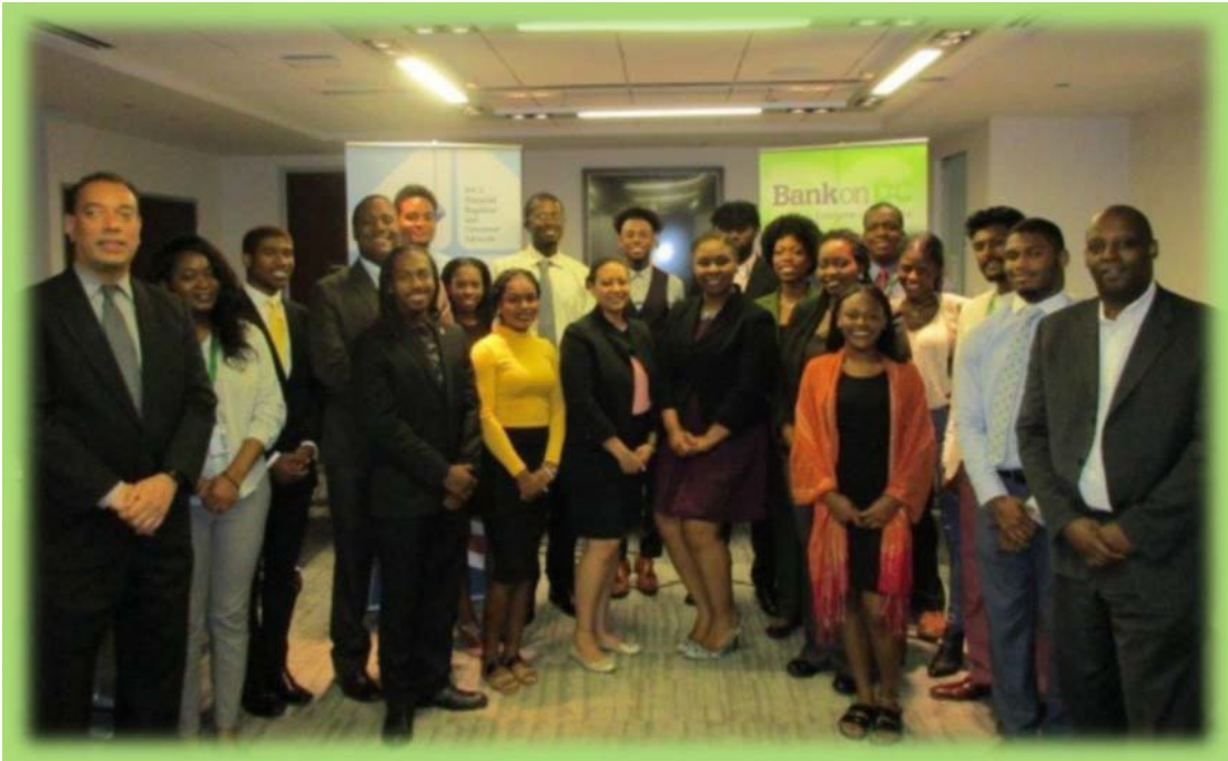
2016 Bank on DC Young Money Manager Program at DISB

▶ Learn more about getting a Photo ID by visiting www.dmv.dc.gov